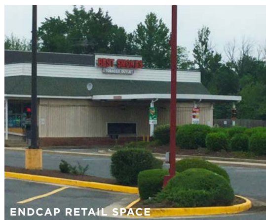
ENDCAP RETAIL SPACE