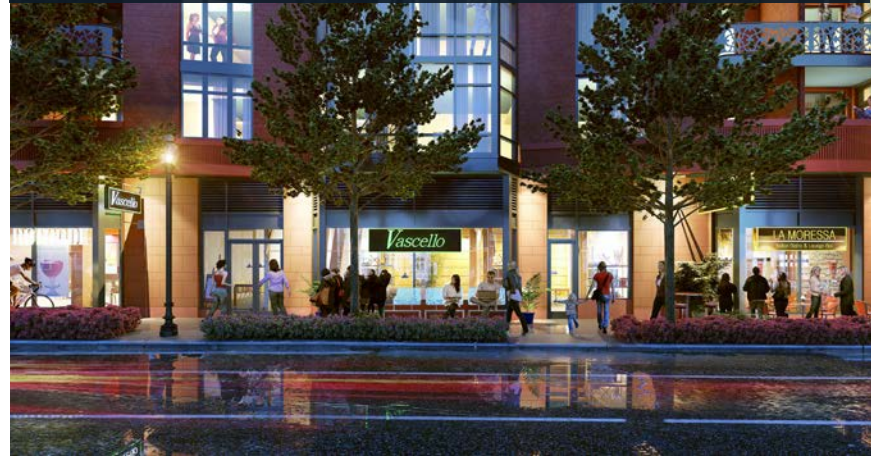
VIEW NORTH FROM 9TH STREET