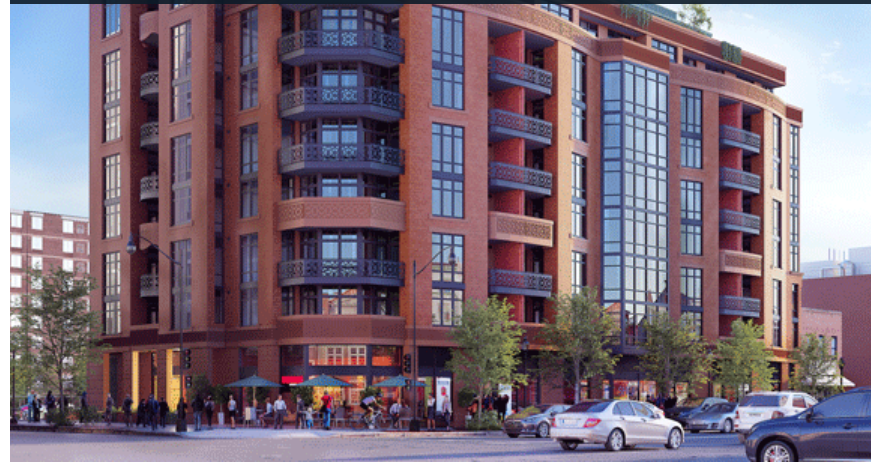
VIEW EAST FROM 9TH STREET